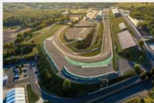
THE BUDDH INTERNATIONAL CIRCUIT