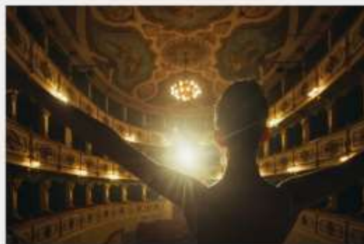
UPCOMING FILM CITY