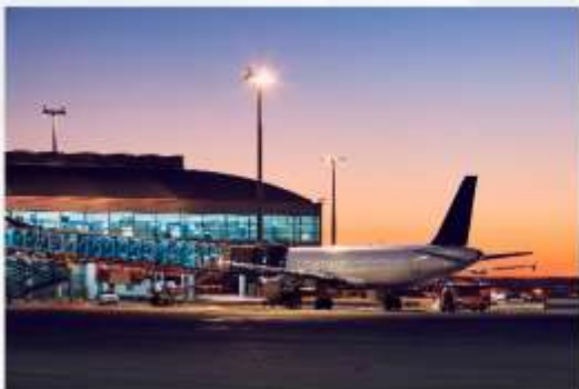
NOIDA INTERNATIONAL AIRPORT