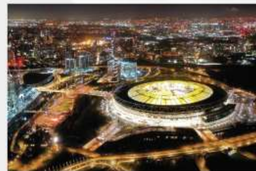
UPCOMING OLYMPIC PARK